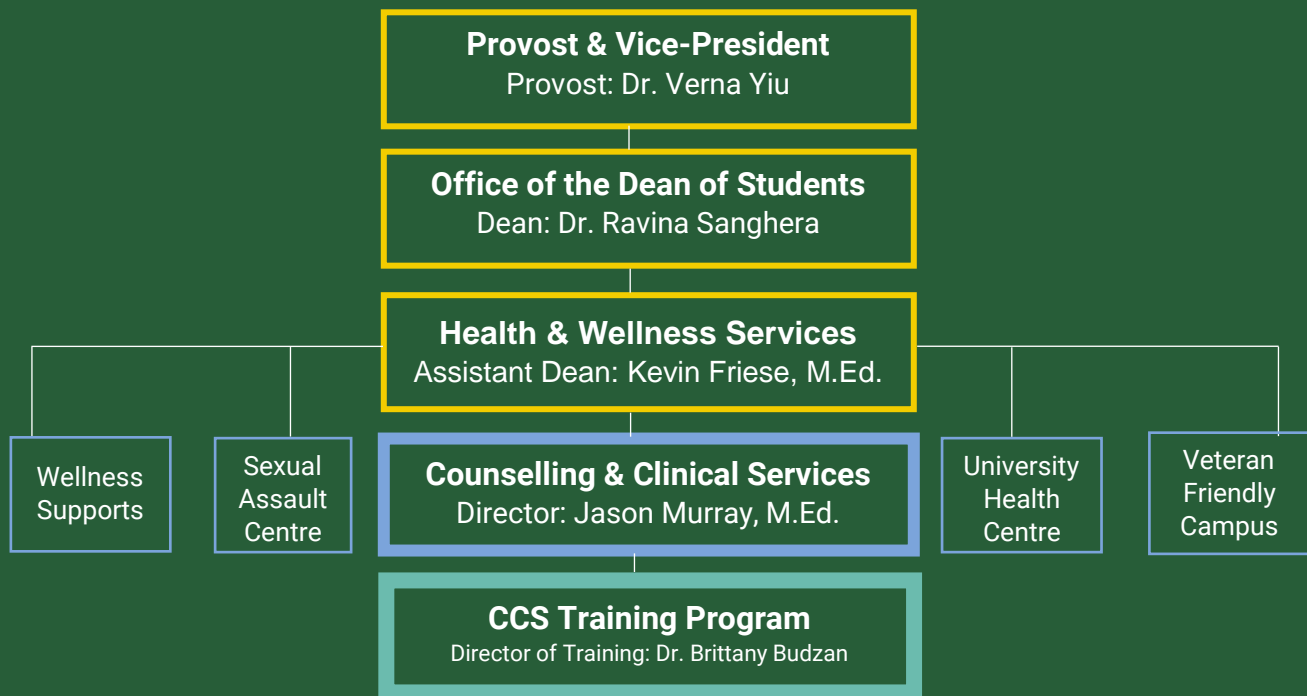
Figure 1. Organizational Structure of Counselling & Clinical Services

CCS is a branch of the Office of the Dean of Students within the University of Alberta. CCS is a multidisciplinary professional agency staffed by 13 registered psychologists, three social workers, approximately three to six psychologists-in-training who are supervised by senior staff, eight part-time psychiatrists, two mental health consultants (MHCs), and four administrative support staff. Our services are available to all students who pay student services fees, and individual counselling sessions are available at no additional cost to the student. Students are seen primarily for individual and group counselling; we also provide couples counseling, workshops for students or staff, consultation and, less frequently, vocational testing. Presently CCS serves a student body of approximately 40,100 students from 156 countries.